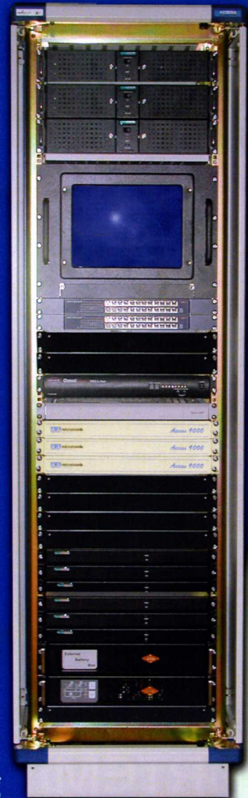
Artemis Gate - Redundant System

providing state of the art communication systems for the aviation industry